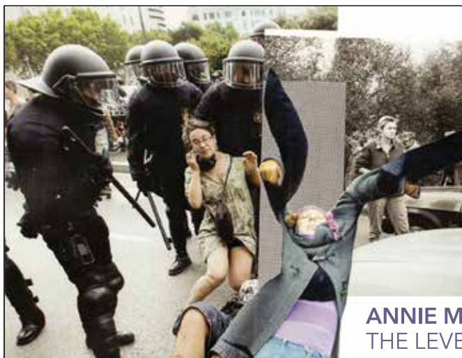
Annie Macdonell, Untitled Collage , 2017, Collage on paper.